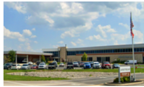
AIRSTREAM INC's LIVE RIVETED BLOG (page 3)

Feb 19 th ; Celebrated May 18 th - 21 st at our Topaz Resort Rally