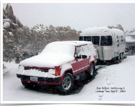
< Some photos courtesy of various Facebook posts – editor >