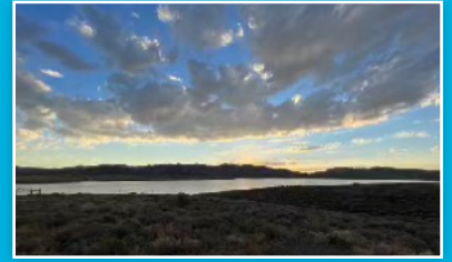
Wild Horse (SRA) Rally north of Elko, NV May 26-29