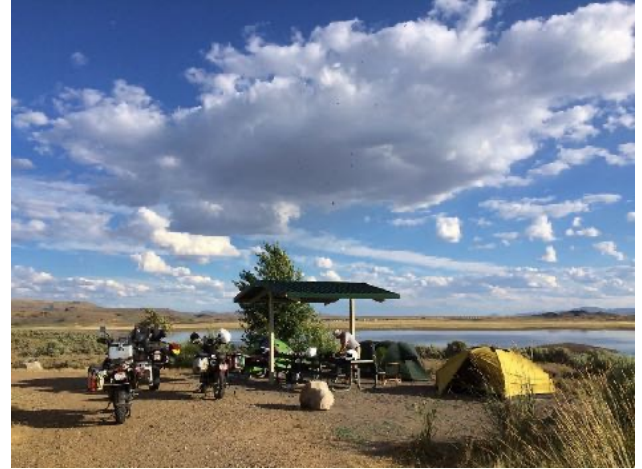
Imagine your BMW, err I mean Airstream overlooking Wild Horse Reservoir

Our May Rally will be held at Wild Horse State Recreation Area, Monday the 26th through Thursday the 29th. Nevada says "Remote and remarkable, Wild Horse State Recreation Area is open year round. The reservoir near the park is a popular fishing site, with rainbow and German brown trout, small mouth bass, yellow perch and catfish awaiting able anglers... Extraordinary wildflowers blanket the park in the spring, and summers offer swimming, boating, camping and hiking. Although hunting is not allowed in the park, the campground is a popular base camp for hunting in the surrounding area. Wildlife includes pronghorn, mule deer and elk as well as a variety of waterfowl and upland game birds."