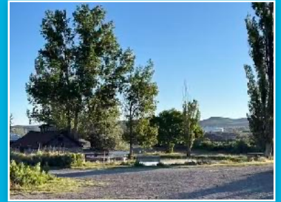
Sheldon Wildlife Rally Virgin Valley Campground west of Denio, NV June 16 - 19