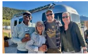
ERIC MCHENRY'S PRESIDENT'S CORNER (page 1)