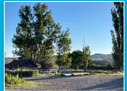
Sheldon Wildlife Rally Virgin Valley Campground west of Denio, NV June 16 - 19