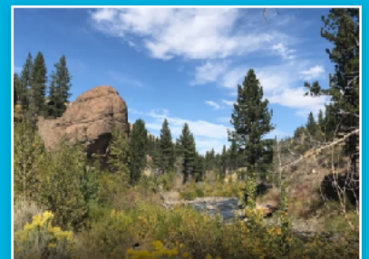
Markleeville Rally Centerville Flat Dispersed Campground July 14th - 17th