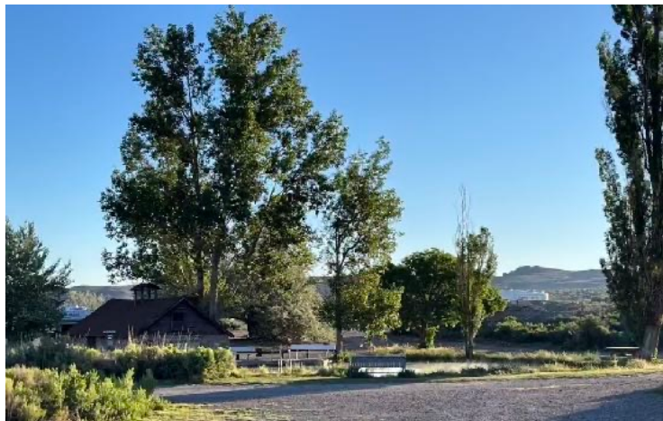
Sheldon Hot Spring fed Shower Room & Pond

Sheldon Wildlife Rally requires a long caravan to reach Virgin Valley Campground, 290 miles from Reno but you can always break it up into a two day jaunt if you like or find another SNU member to caravan with.