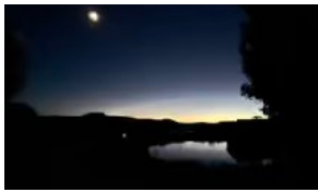
SHELDON WILDLIFE RALLY (Page 2)