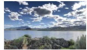
Wild Horse Write Up (page 3)