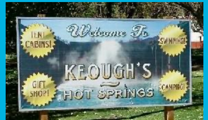
Return from Region Rally; Keough's Hot Springs October 19th - 22nd