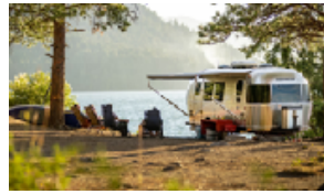
AIRSTREAM INC'S LIVE RIVETED BLOG (page 2)