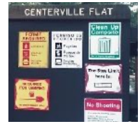
CENTERVILLE FLATS RALLY REPORT (page 4)