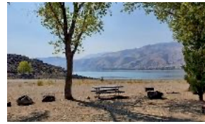
SNU 49TH ANNIVERSARY RALLY - TOPAZ LAKE OCT 9TH - 12TH (page 4)