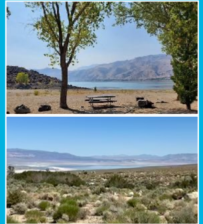
Route to Region 12 Caravan/ Rally, Topaz Lake (SNU 49th Anniversary Rally) and Tuttle Creek October 9th - 15th

Airstream Flying Cloud 30FB Bunk: a Family's Home away from Home - The Weiss family's adventures include stargazing, hot air balloons, camping, crossing the great plains, Rockies and visiting Grand Canyon. The 30' front bedroom bunk gives them space to work, lounge, sleep and eat, even becoming a classroom for homeschooling their kids along the way, without having to encroach, setup or break down their living space. Read more about their home here; https://www.airstream.com/blog/airstream-flying-cloud-30fb-bunk-a-familys-home-away-from-home/ .