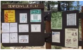
ANTELOPE LAKE RALLY AUGUST 11th - 14th