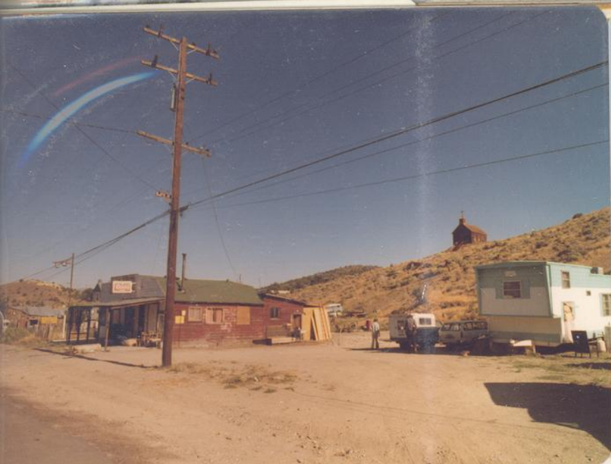
27 going up the Smoky Valley (exquisite) to Manhattan, above and below. We did want to go on Belmont, but four wheel drive is needed.