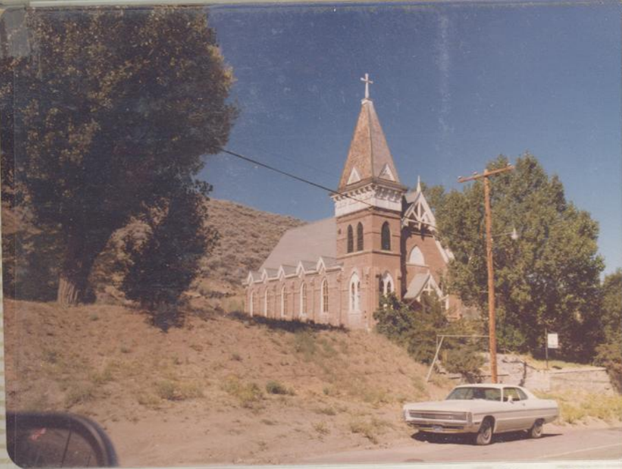
8-28 through Austin enroute to Fallon. The old Episcopal Church and the old Court House.