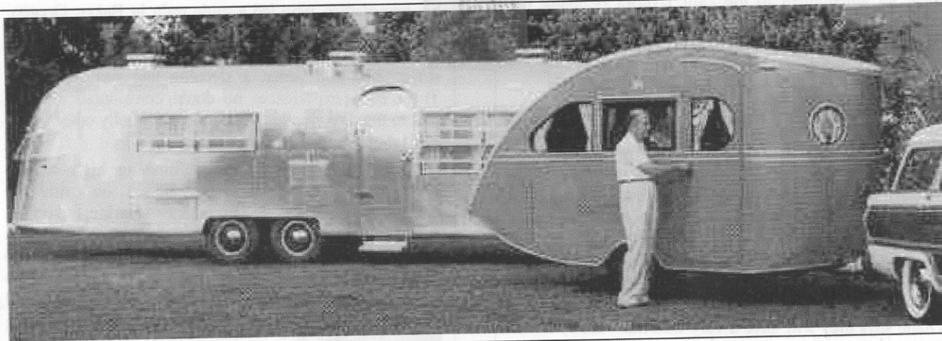
1935 AIRSTREAM (back) and "TORPEDO" built from $5 plans

The 2 nd copy of the newsletter is to use to introduce potential members to our unit. We hope you will find it useful in your recruiting efforts. We need to build our membership. If you see an Airstream and can't find the owner, tape one to the door.