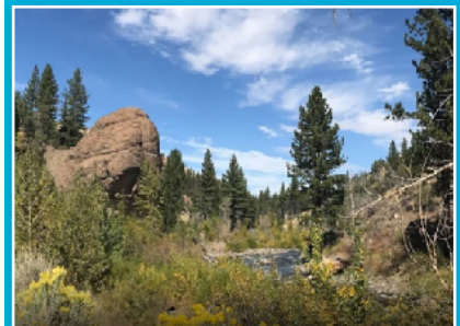
Markleeville Rally Centerville Flat Dispersed Campground July 14th - 17th