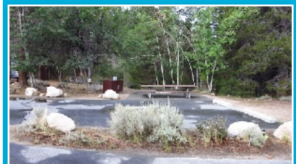
Lower Twin Lakes Rally Bridgeport, CA August 23rd - 28th