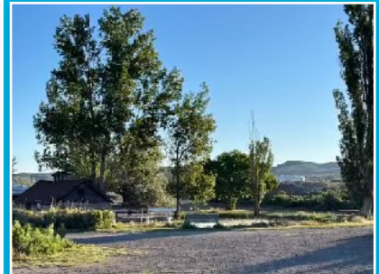
Sheldon Wildlife Rally Virgin Valley Campground west of Denio, NV June 16 - 19