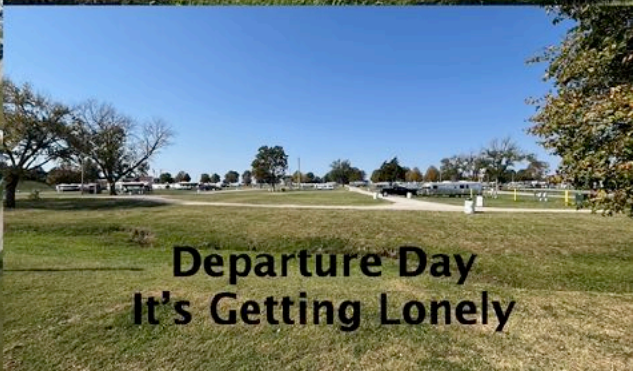
Departure Day It's Getting Lonely