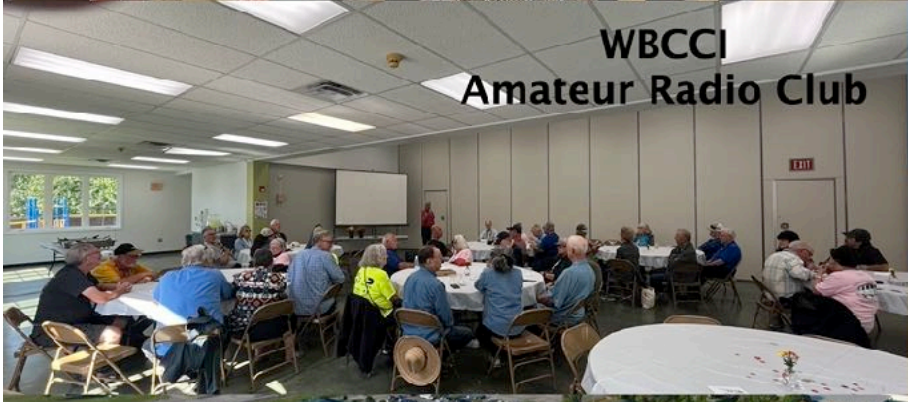
WBCCI Amateur Radio Club