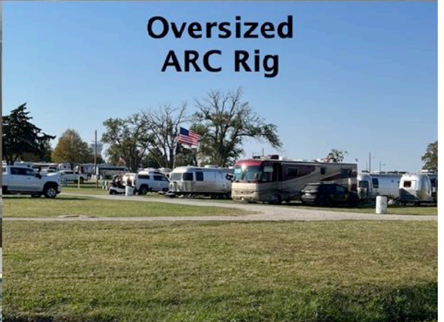
Oversized ARC Rig