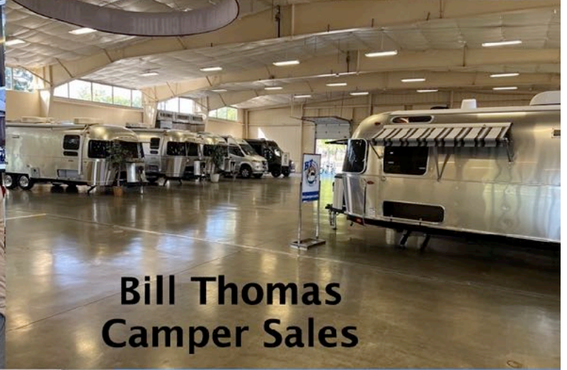
Bill Thomas Camper Sales