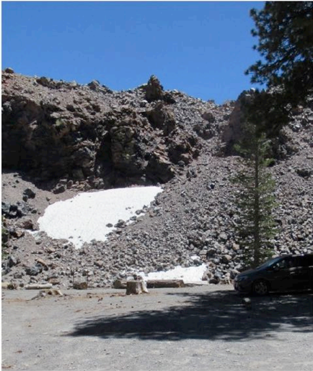
Snowfields at 8200' in July