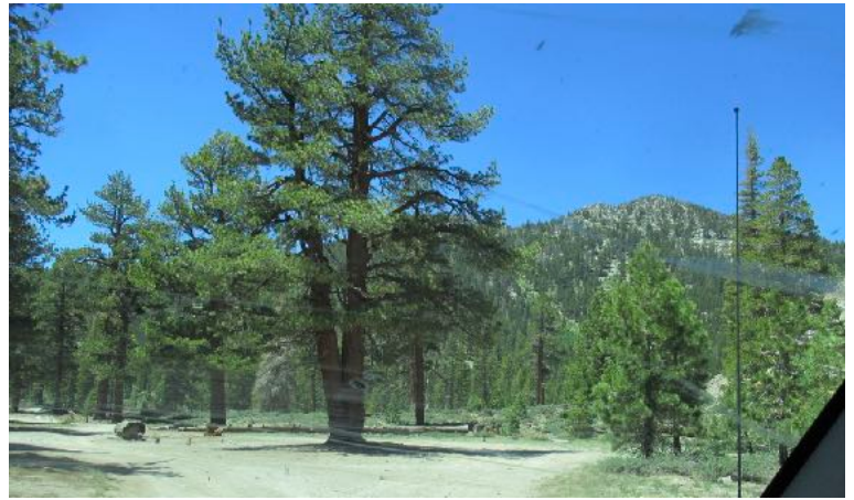
Obsidian Dome Rally Site

access; on the SNU 1 to 5 scale I'd rank it an 8!>>