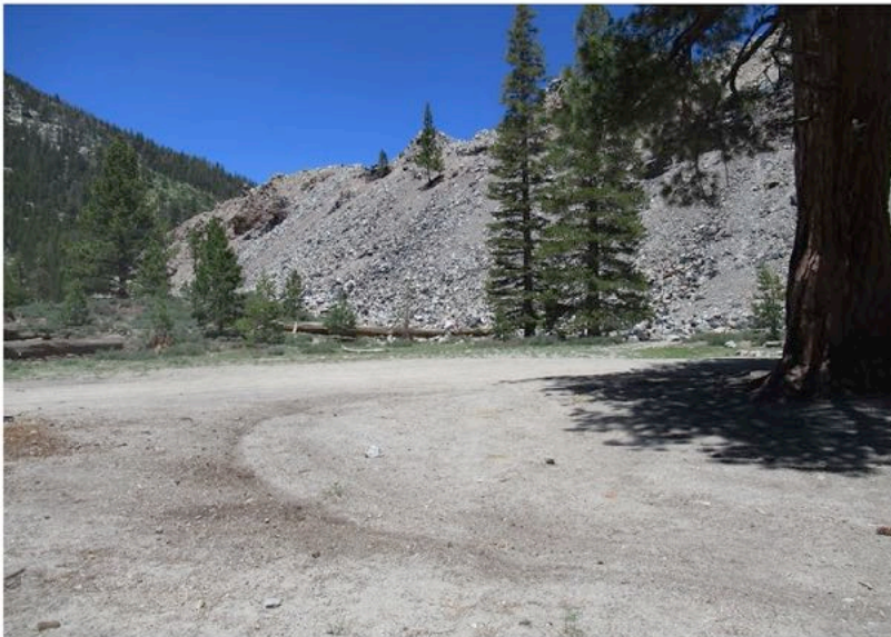
Obsidian Dome Backdrop