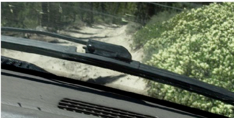
Potholed, Rutted & Sideslope