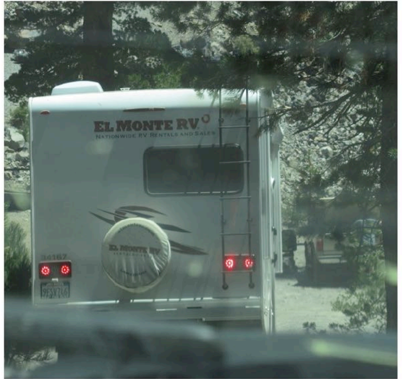
Rental turned before the bad stuff!