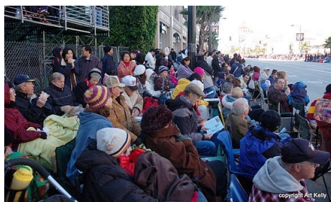
WBCCI rally participants had a front row seat