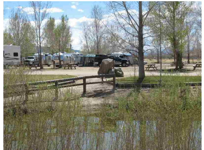
Pretty grounds at the Walker River Resort