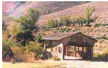
Covered Bridge