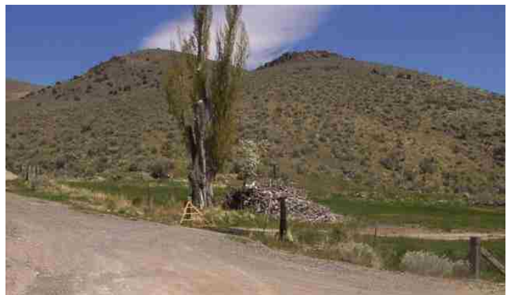
Gate into camping area

May Rally at Unionville - Location: Off of I 80 East. About 60 miles East of Lovelock. Take exit 149 (about 44 miles from Lovelock) towards Mill City/Unionville, go 0.1 mile. Turn right onto NV-400, go south 16.6 miles. Turn west (right) onto the gravel road to Unionville, go 2.1 miles. (there is a green road sign telling you the turn is coming up). Go up the canyon (a very slight incline) 4.1 miles to the campsite (park). Note portions of this road, i.e. the section to Unionville is unpaved. It is good gravel, wide enough for Airstreams and no steep grades.