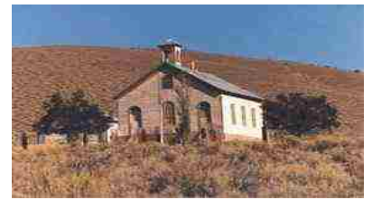
Buena Vista School - Heating stove stands in center- map of Africa on wall was made in 1887.