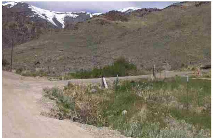
Road and gate into camping area