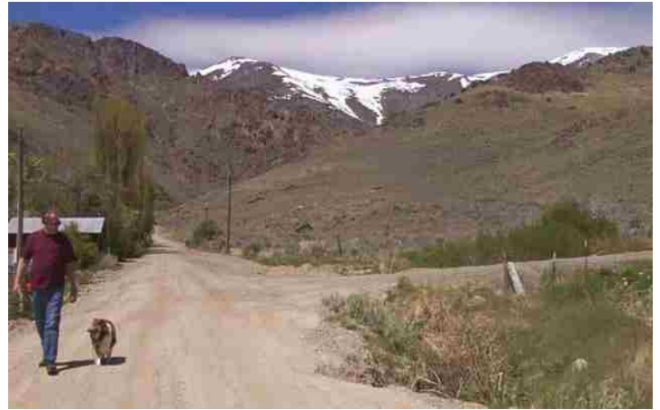
Stay left and make wide right turn