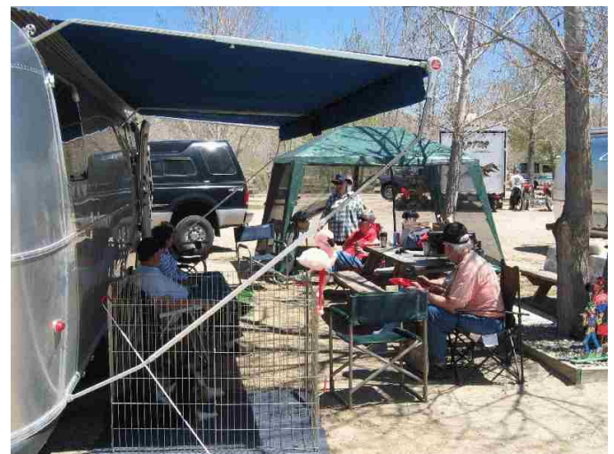
Chillin' out at Thornburg's Airstream