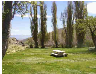
Picnic table area