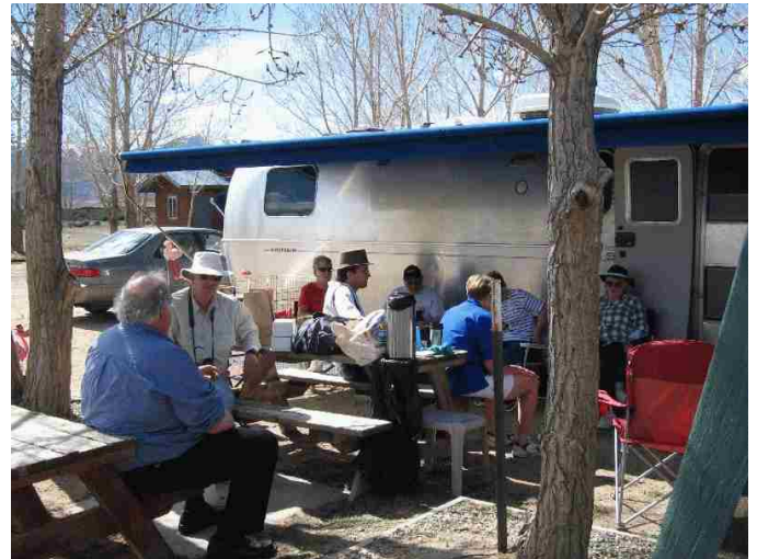
Happy Campers at the April Rally

It was then discussed if the unit should now, because of our increasing membership, consider electing a vice president for the unit. This position would assist the president, fill in at times the president was absent, and be a yearly elected office. It would not be a position that would immediately move to president the next year as it is with the WBCCI. It was discussed that maybe the directors be given some additional responsibilities. Of the three positions, one might be delegated to marketing and promoting the WBCCI and the Sierra Nevada Unit, one doing the rally schedule and locations for the following year, and the third doing the newsletter.