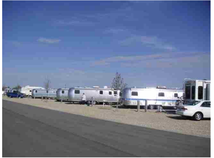
The Idaho Unit has about 50 rigs and about 100 members. There were about a dozen rigs at this rally, including a couple of class A Airstreams.