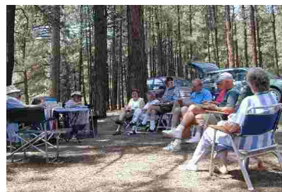
2002 Davis Creek Rally