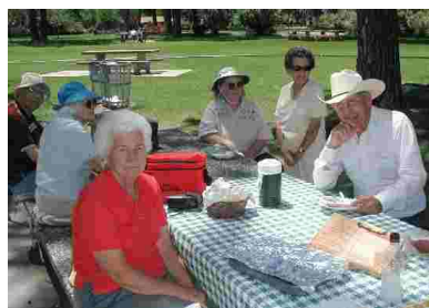
2001 Mills Park Picnic