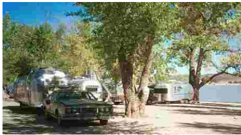
1996 SNU Lahontan Rally