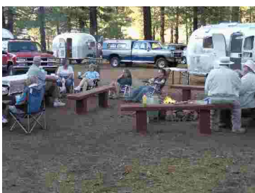
Boca Lake in 2004