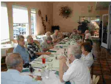
SNU Luncheon 2001