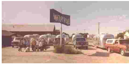
1980 SNU Mid Nevada Caravan ready to leave Fallon.