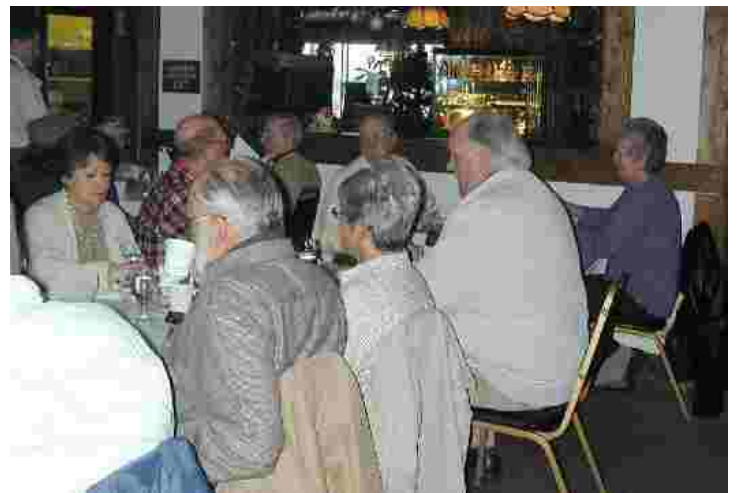
Happy Campers at Luncheon