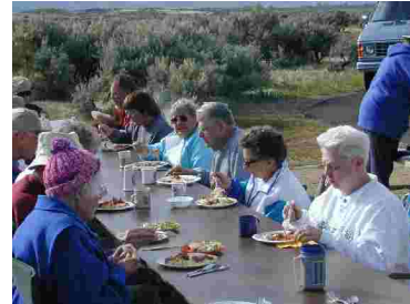
2000 Washoe Lake Rally