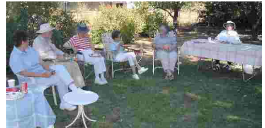
Sept 2001 Picnic at Leipper's