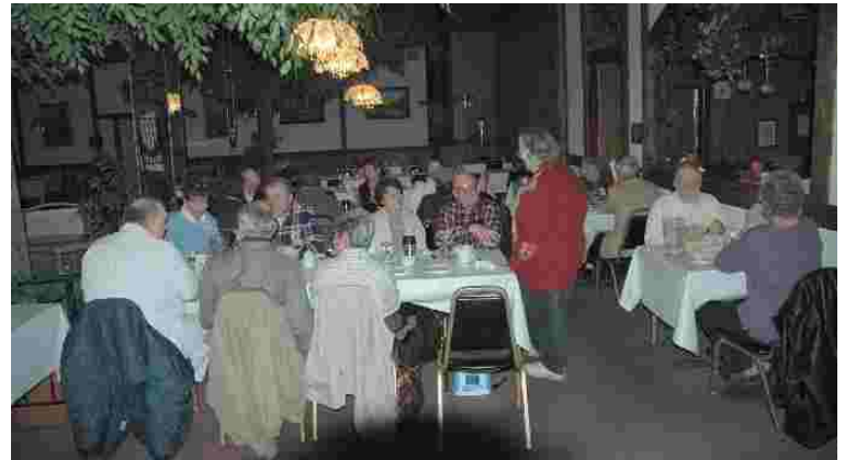
January SNU Luncheon at Bavarian World