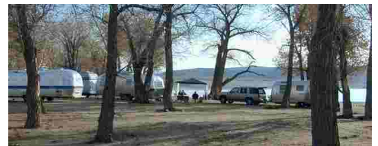
2003 Lahontan Lake Rally