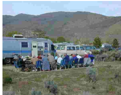
2000 Washoe Lake Rally