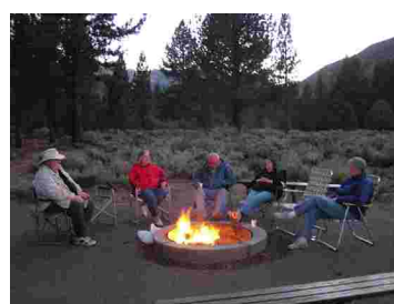
Twin Lakes in 2004