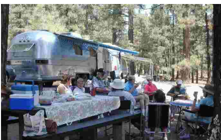
2002 Rally at Davis Creek