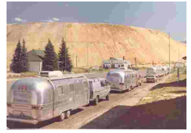
1980 Caravan at Kennecott