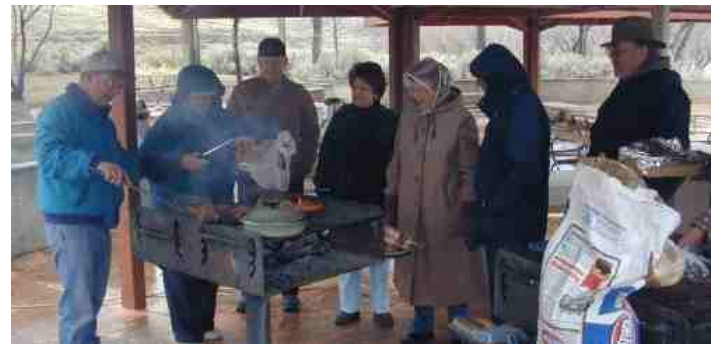
Cold, but it sure smells great