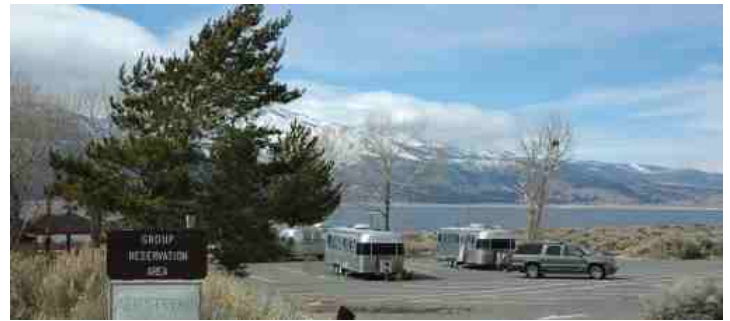
March 2006 Rally at Washoe Lake State Park