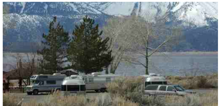
Circling the Wagons