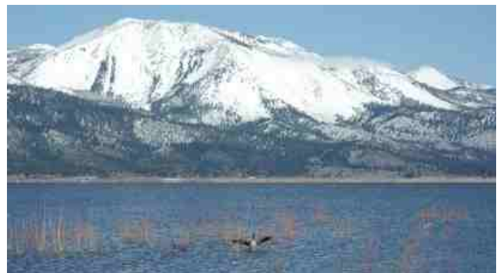
Canada Goose on Washoe Lake