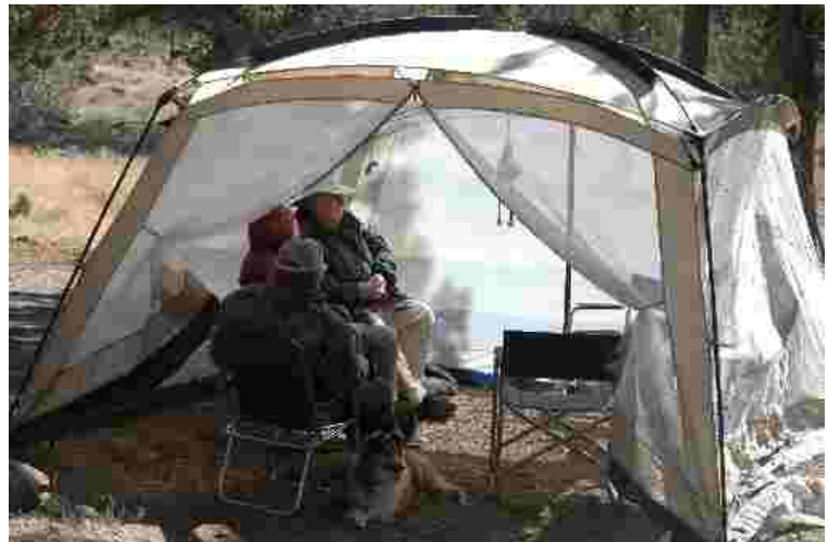
Morning Coffee Klatch