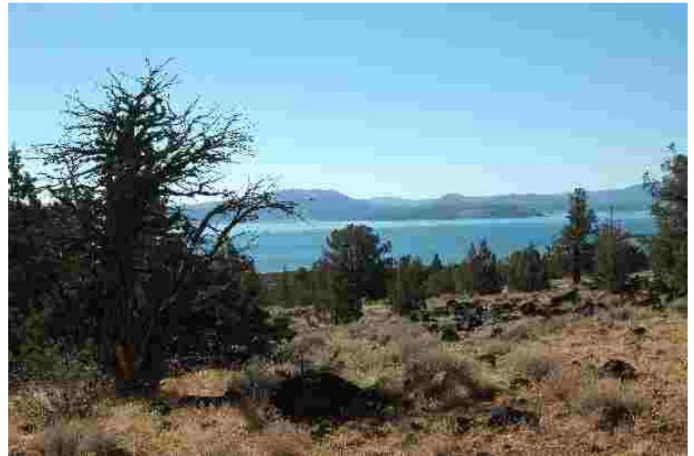
View of Eagle Lake from upper campground