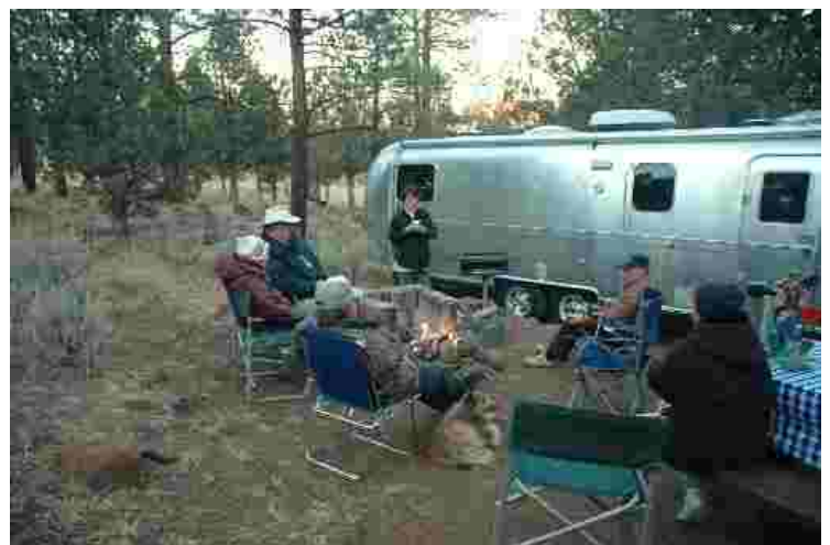
Enjoying the Campfire