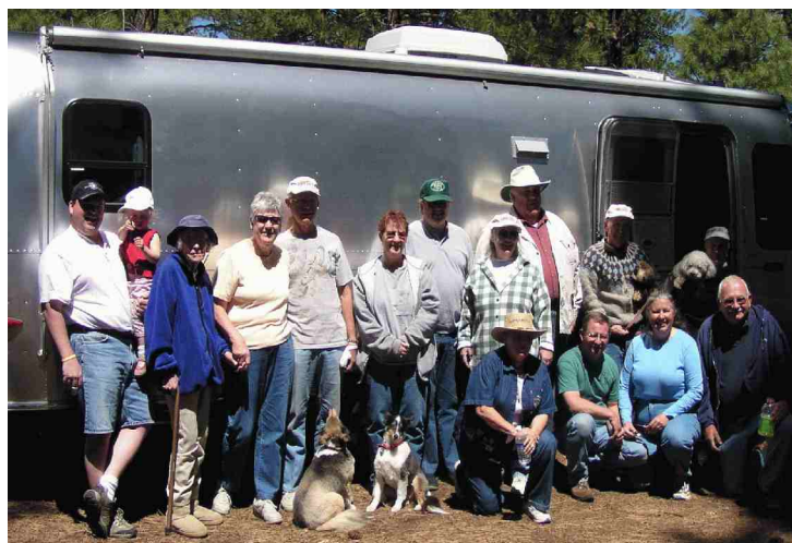
Happy Campers at Boca, in front of 28' Safari from Mt Family

More details on these and other events are on the web and will be included in future newsletters