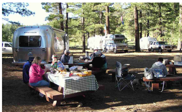
Relaxing in front of Mt Family RV 2005 Safari