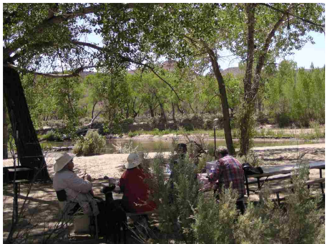
Lunch along the Carson River at Ft. Churchill