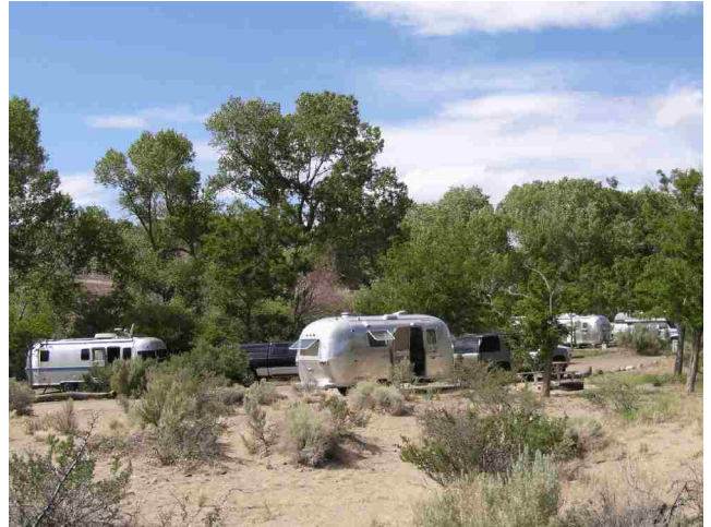
Airstreams at Dayton State Park

The July Meeting will be at the Spooner Summit State Park off State Hwy 28 near Zephyr Cove. Spooner Lake is popular for its abundant wildlife and wildflowers, and has a very nice two mile hike around the lake. Nearby attractions include the Lake Tahoe beaches and the Ponderosa Ranch. (May be last time to see the Ponderosa Ranch as it will soon become a park.)