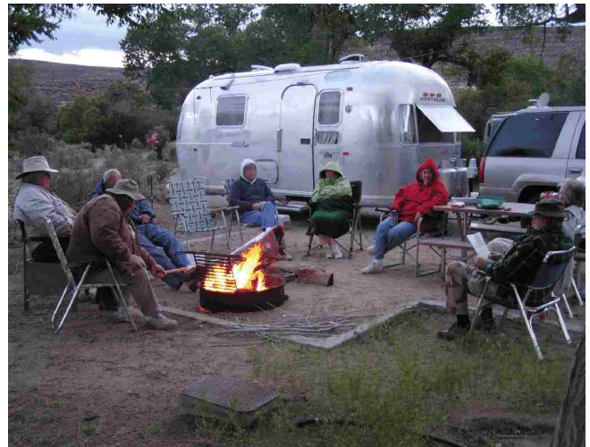
Campfire next to Douglas' 1972 Bambi