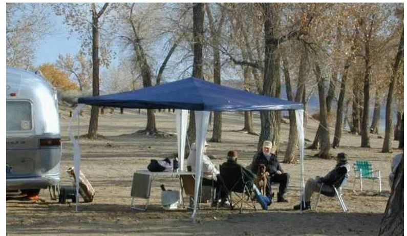
Chillin' at Lahonton