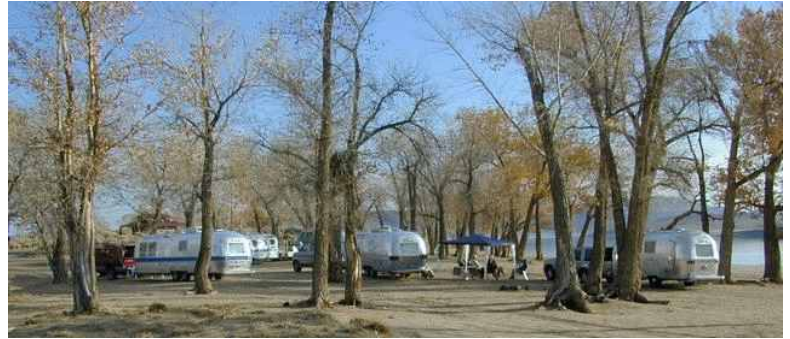
Circlin' the wagons at Lahonton Rally