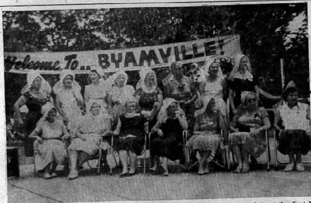
CARAVAN SWEETHEARTS — This group of Sunbonnet Beauties was taken at the first National Rally of the Wally Byam Caravan Club held in Bull Shoals, Arkansas, in 1958. Wisconsin Dells is host to the second National Rally July 1-7, 1959.