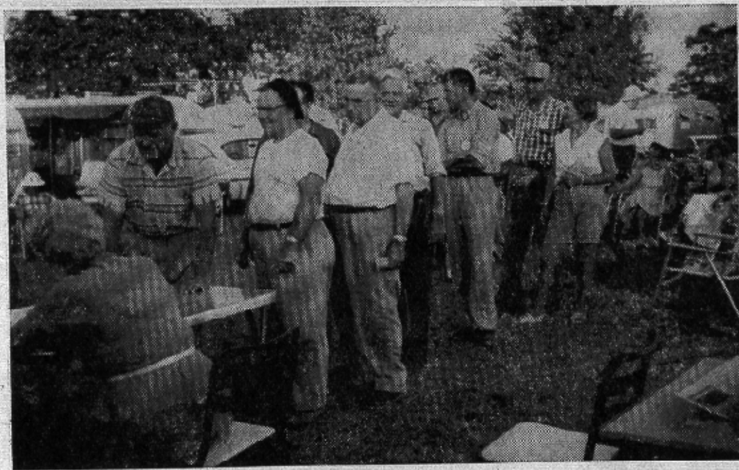
TYPICAL SCENE AT A WALLY BYAM CARAVAN CAMP — Registration is an important aspect of any Wally Byam Caravan Camp. This procedure has been among the preliminary details of the National Rally being held at the Chula Vista Farms, Wisconsin Dells, July 1-7. The above picture was taken a year ago at the rally in Brown County, Indiana.