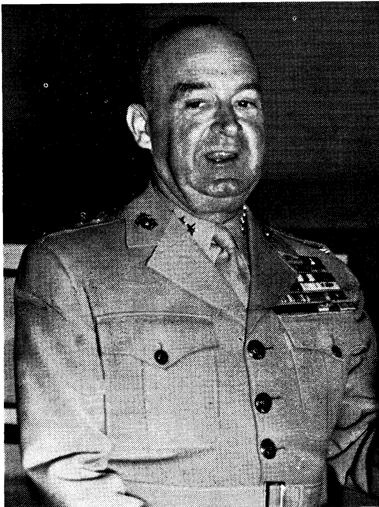
General A. A. Vandergrift, Com- MCB would center all the Marine