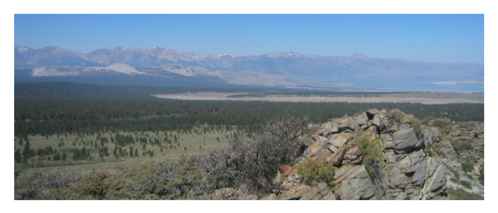
View of Mono Lake, Mono Craters and the Sierra Nevada Range from the top of Sagehen Peak.