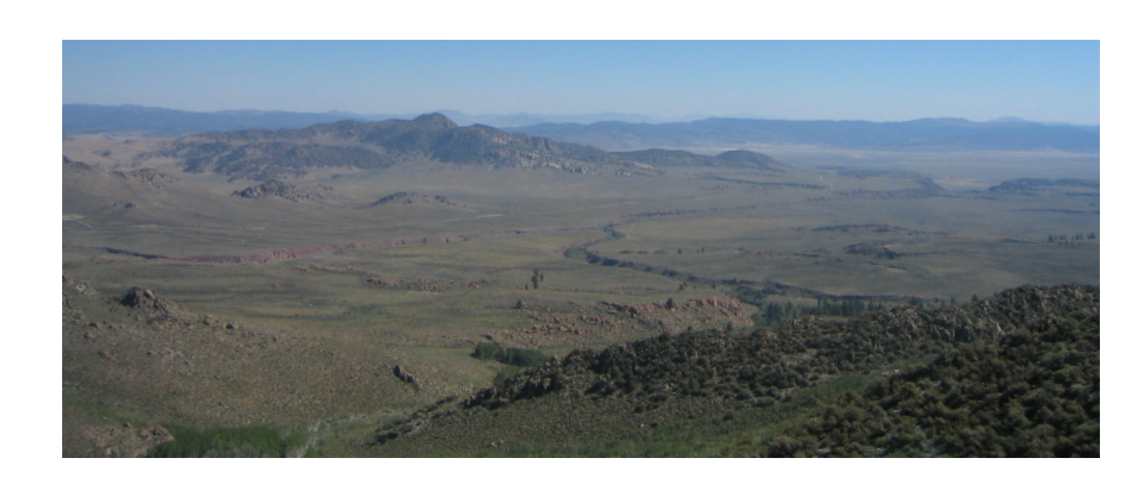
View of Glass Mountain from Sagehen Peak