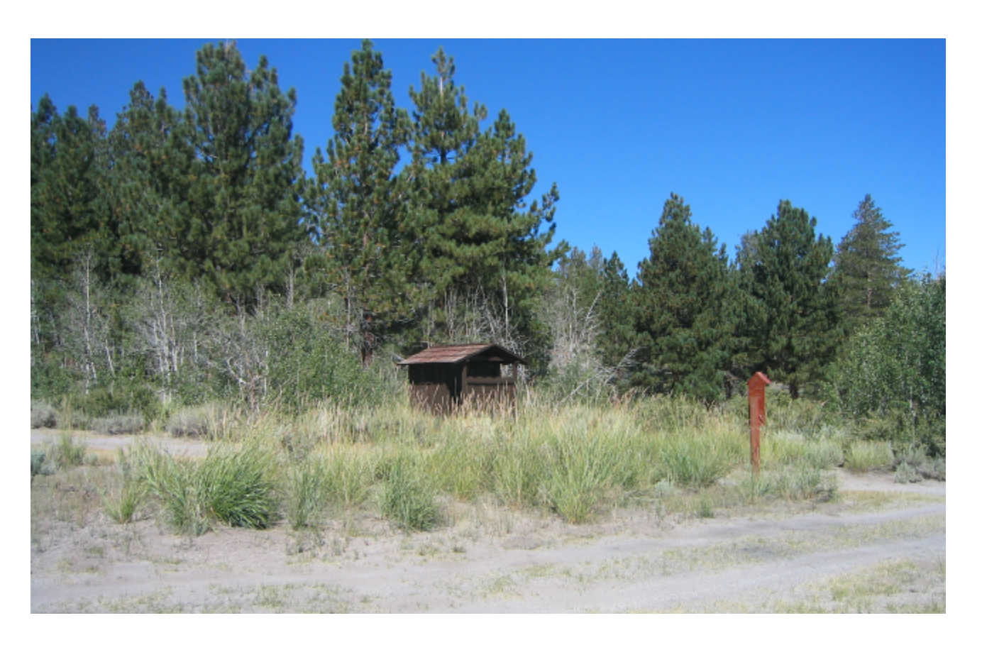
This is the only facility in the area, a small two hole pit toilet, that was clean and supplied when I was last there in Sept of 2005. No potable water in the area bring what you will need with you.